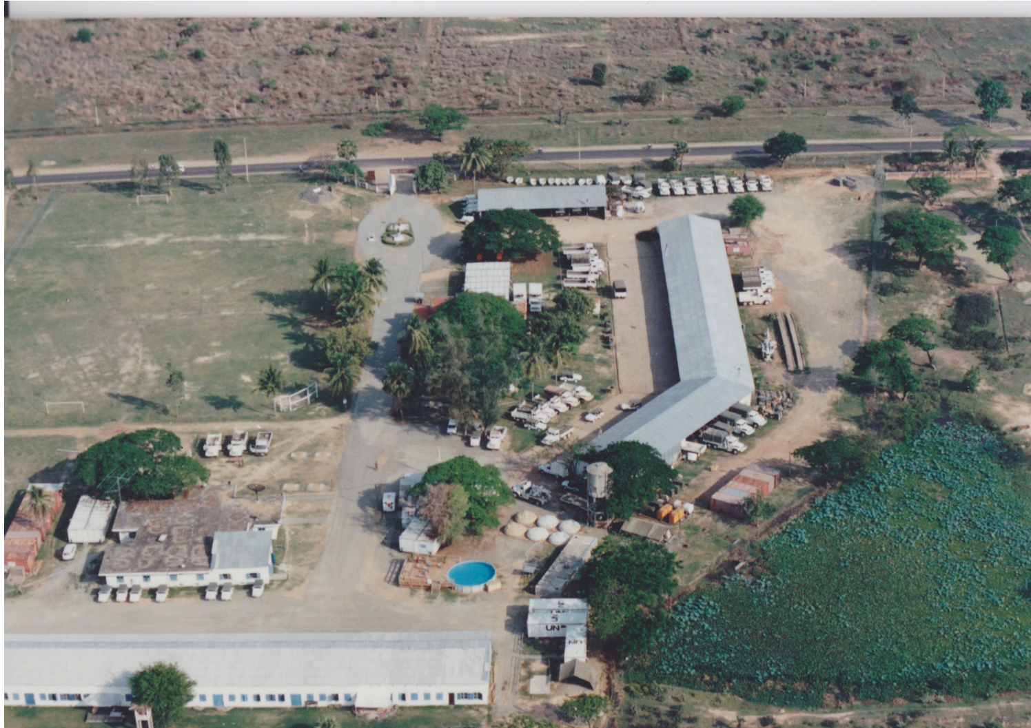
Aerial View of the Camp