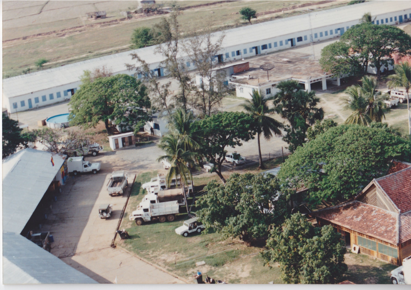
Aerial View of the Camp