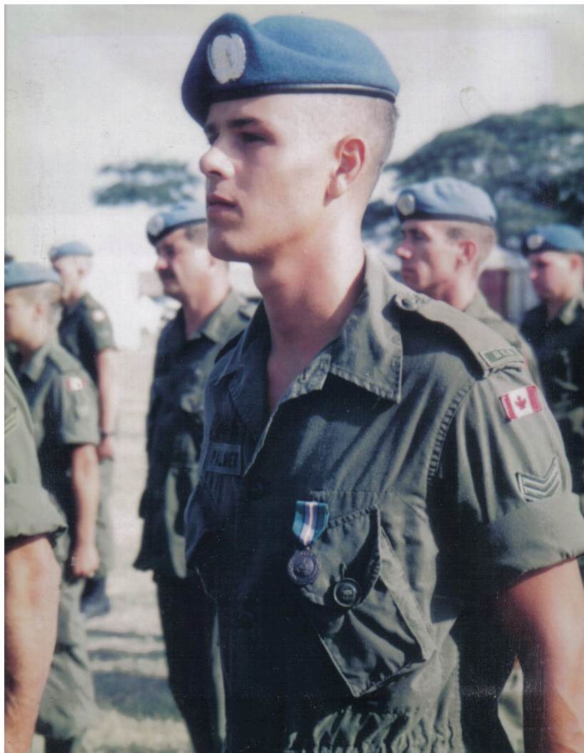
Canadian Medal Parade Ceremony in Cambodia