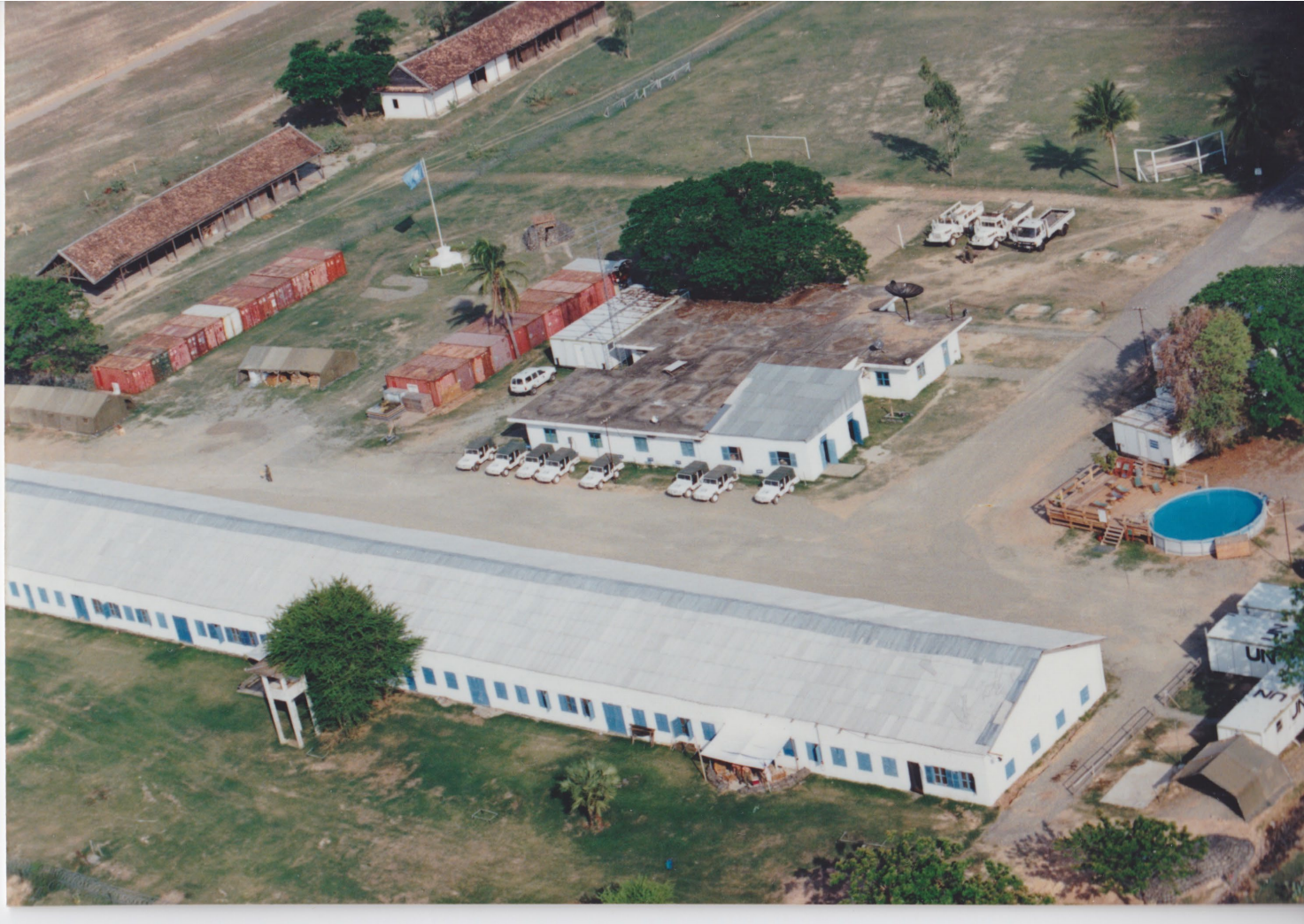
Aerial View of the Camp