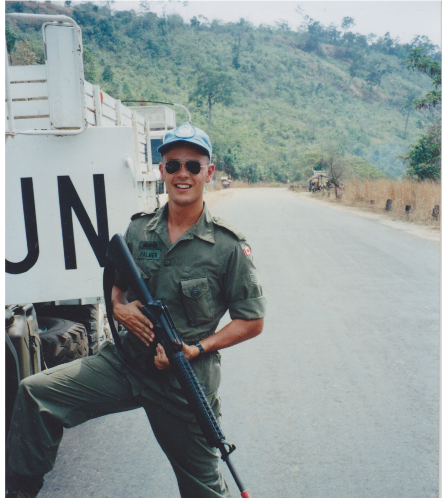
A Typical Roadside Rest Stop