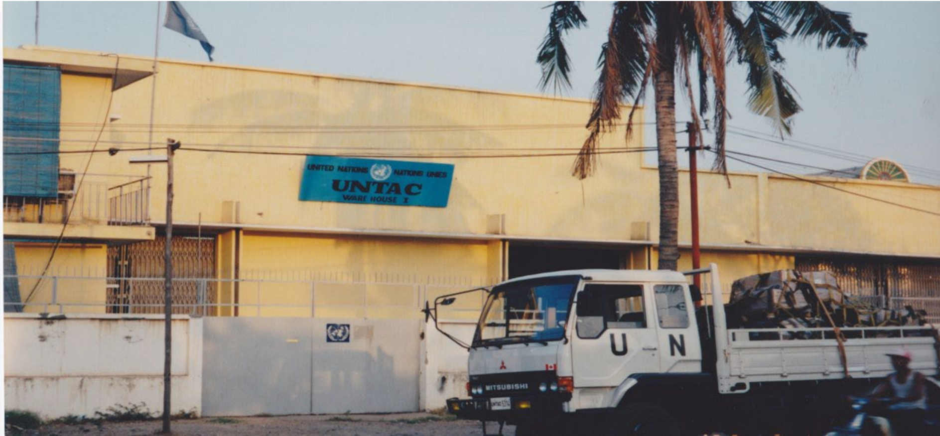
Loading Cargo at a UN Warehouse for delivery to a Secondary Line Logistics Depot