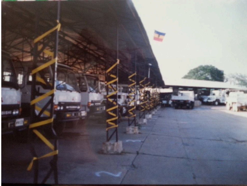
Charlie Platoon Lines