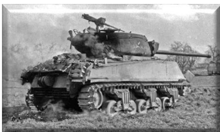
Typical burned & knocked out Sherman