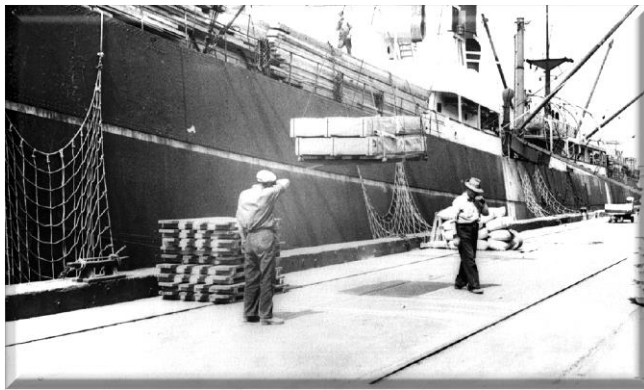
Vancouver docks, 1940's