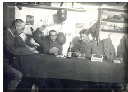
Different war but same scene

The revolver discharge was no doubt the fault of Pots, pure carelessness; the next hair raising incident was not. Still in Germany, cruising through a German village on some official errand, he noticed a woman and small child strolling along the sidewalk just ahead of him. As he drew near, the child suddenly darted out in front of the bike and before Pots could stop, the youngster was run over. (Pots thinks he somehow managed to squeeze through the gap between the wheel and the motor). He quickly stopped, dropped the bike onto the road and rushed back. While this only took a few seconds, it was enough time for the woman and child to disappear into a doorway followed quickly by Pots only to find, to his complete consternation, in addition to the woman and boy, were also three German soldiers sitting at a table playing cards – yikes! Ignoring the threat of the newly benign enemy, he sufficiently contained his fear of any repercussions to quickly